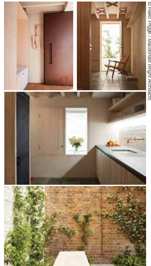
© Heiko Piggel / Macdonald Wright Architects

The Library House at 211 Northwold Road was completed in 2020. It is a crafted, low energy building adjacent to Edwin Cooper's Grade II listed Clapton Library. Designed by Macdonald Wright Architects, the two-bed, two-storey terraced home has an internal floor area matching that of the average UK dwelling (84m 2 ) and sits on a compact plot with a secluded walled garden to the rear.