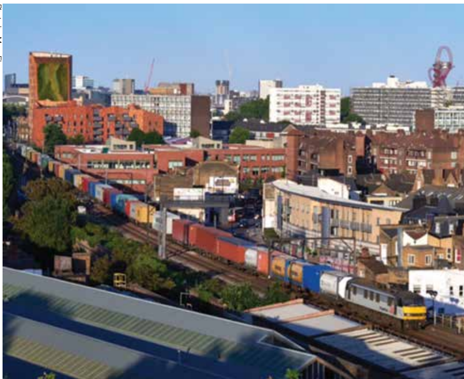
Freight train – from the roof of St Augustine's Tower

Spaces is published by the Hackney Society. Views expressed in the articles are not necessarily those of the Society.